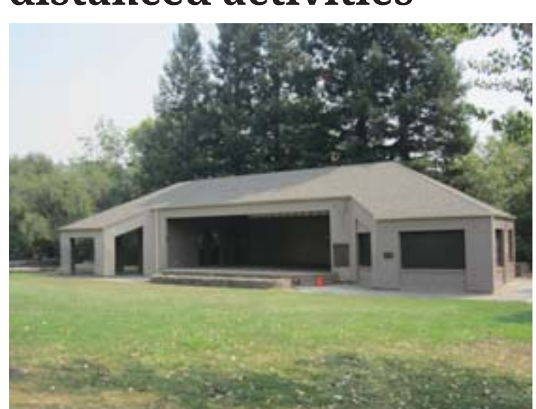
Moraga Commons Park bandshell